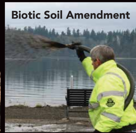
Biotic Soil Amendment